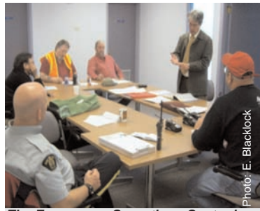
The Emergency Operations Centre in Fort Simpson

Each year, DoT collaborates with Municipal and Community Affairs (MACA) to put on an emergency exercise involving an aircraft mishap in one of the six largest communities. With the help of community volunteers, including fire, ambulance, and health care personnel, the Fort Simpson exercise tested the response to a scenario involving a plane collision and resulting forest fire which threatened homes and lives. Students from the Thomas Simpson Secondary School served as the crash "victims".